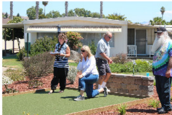
Triathlon - Bocce Ball