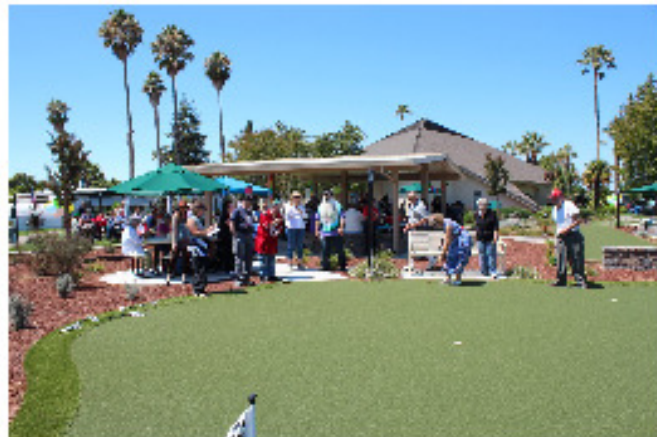
Triathlon - Putting Green