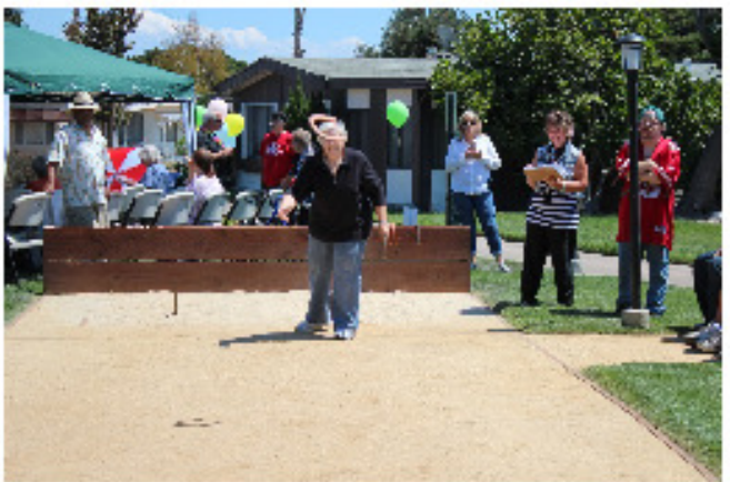
Triathlon - Horse Shoes