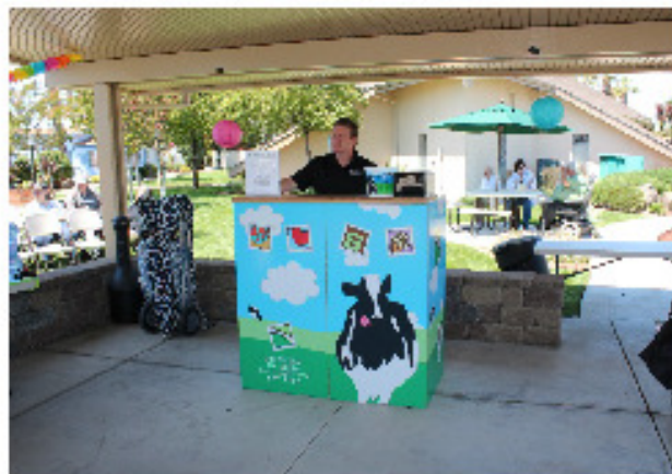
Ben & Jerry's Ice Cream