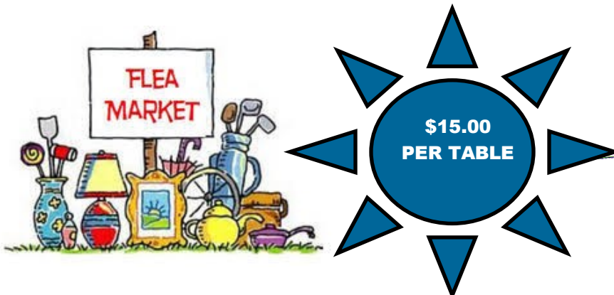
Table Requests will begin on October 14 Forms Available ONLY in the Clubhouse for residents only

Gwen Carter — Chairperson @ 510-861-9411